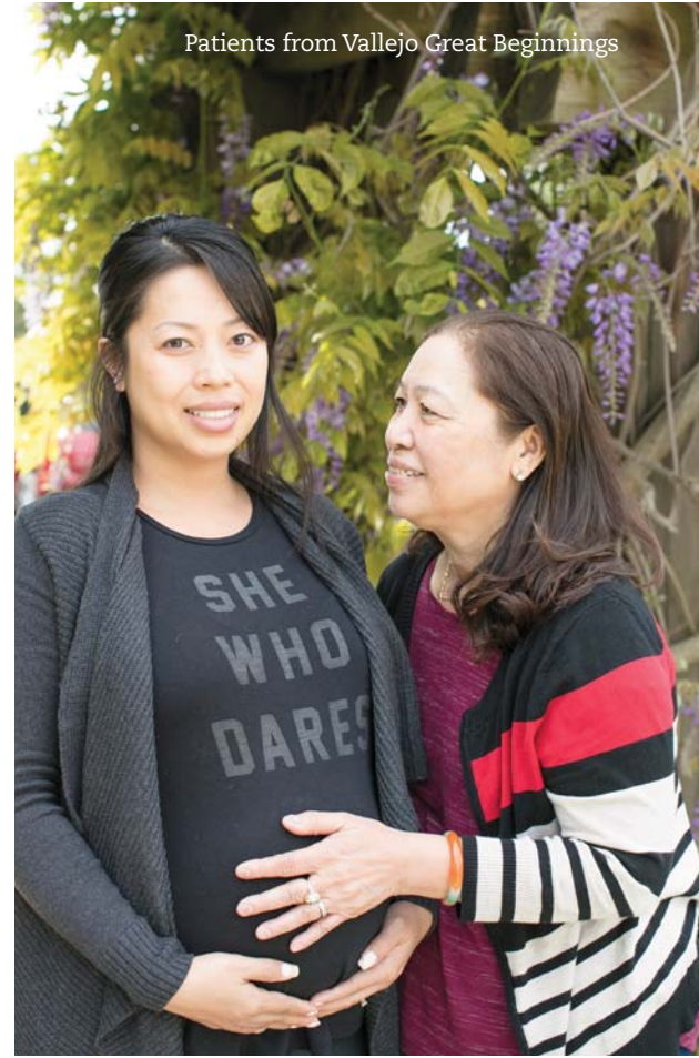
Patients from Vallejo Great Beginnings

Lincoln Avenue Spa Livermore Valley Performing Arts Center Lungomare Make Westing The Marker Markham Vineyards Mount St. Helena Golf Course Napa & Sonoma Valley Bike Tours Niles Canyon Railway Oakland Ballet Company Oakland Symphony Pacific Pinball Museum Point Reyes Outdoors Red Hen Cantina S.S. Jeremiah O'Brien San Francisco Ballet Semifreddi's SF Air Tours SF Bay Adventures Southwest Airlines USS Hornet Museum Wacky Jacky Workday Yoshi's Restaurant & Jazz Club