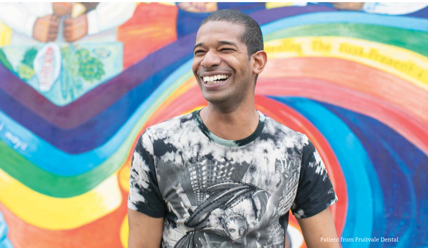
Patient from Fruitvale Dental